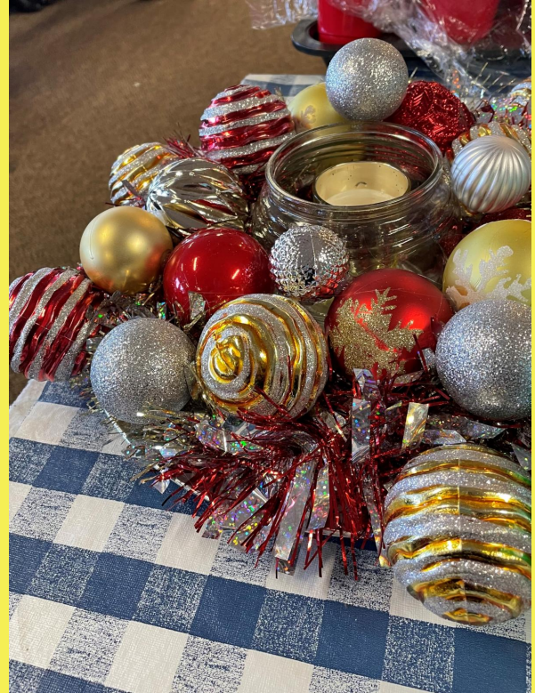
Table decor at Holiday Party