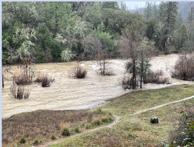
Bear River, January 2023

Gold Country Writers is a non-profit volunteer organization of writers that meets every Wednesday at the Auburn City Hall Rose Room from 10:00 a.m. to noon. At this time we are meeting in the Barnstormer Event Center, Auburn Airport, 13626 New Airport Road. Email goldcountrywriters1849@gmail.com to join or find out more. Website: goldcountrywriters.com . Facebook: Gold Country Writers. Mailing address: P.O. Box 5991, Auburn, CA 95604.