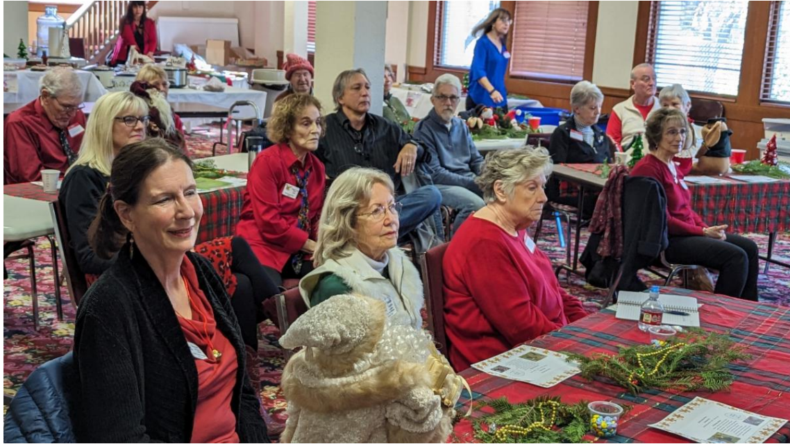
A well-attended Holiday Party was enjoyed by all.