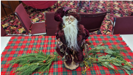
Santa Claus decor