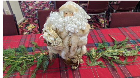
Snow Santa