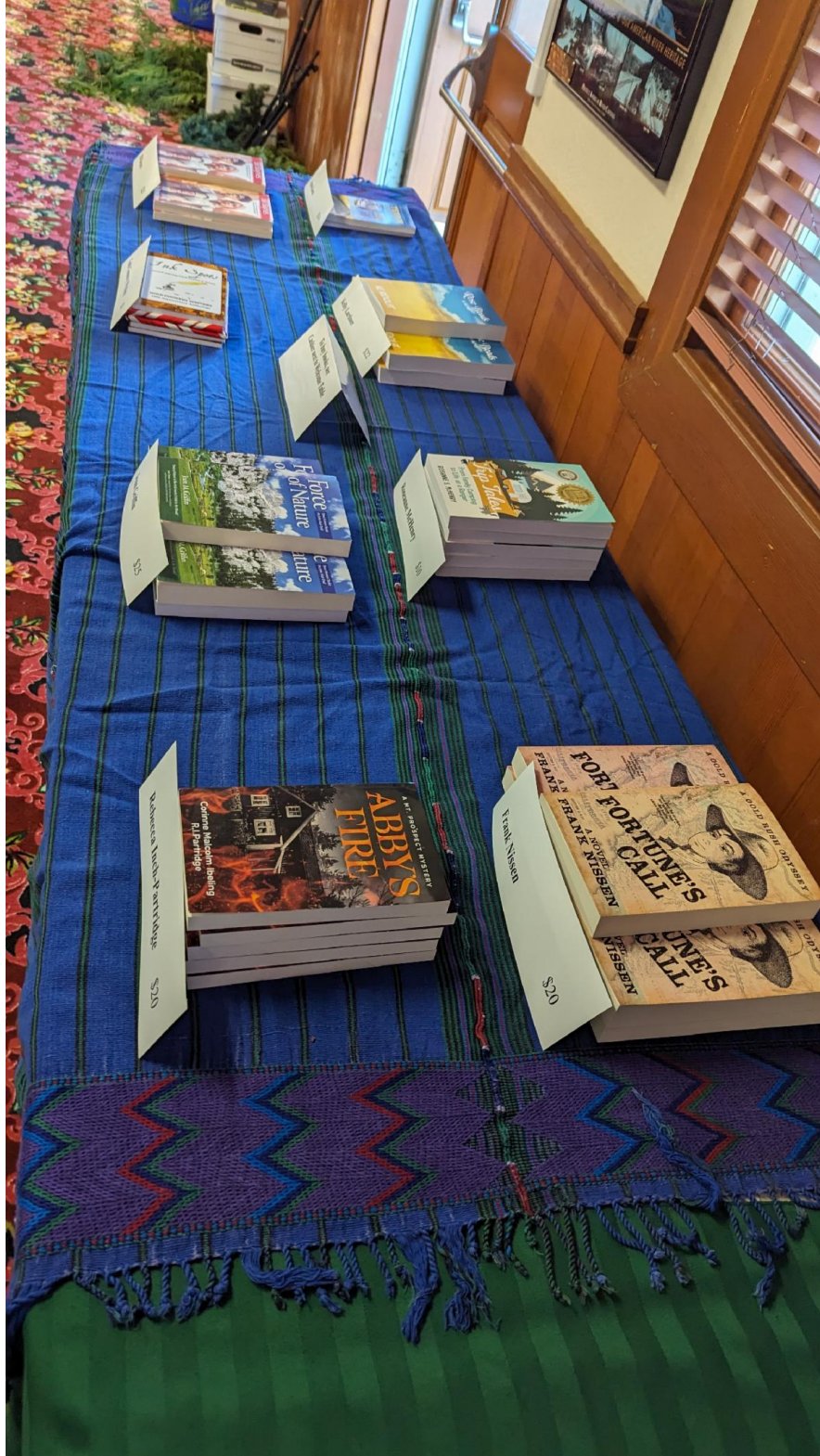
Books for sale by GCW Authors at Holiday Party.