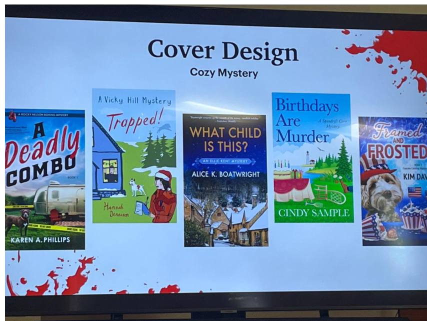
Examples of Phillips' book cover designs for the Cozy Mystery genre