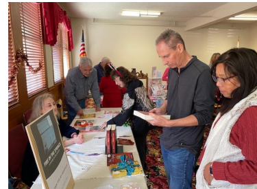
Pop-Up Holiday Book Sale after the party.